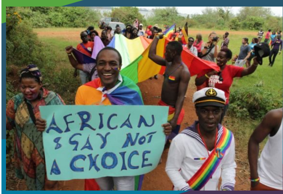
Pride March in Ugada

"It is Homophobia and not Homosexuality that is foreign to Africa "